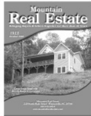
Mountain Real Estate