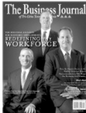
The Business Journal